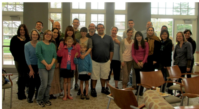
Potluck attendees on April 27, 2013.

Members of the Second Language Studies/ESL community at Purdue gathered Saturday, April 27 to relax and celebrate the end of the 2012-2013 academic year. A wide variety of dishes were brought to the potluck party. Students and faculty then simultaneously played some soccer and Frisbee, or FrisbeeSoccer as it is now known!